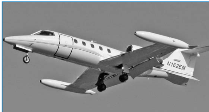
MCH’s fixed wing medical transport aircraft.

The State EMS Bureau of Emergency Medical Services has recognized the LifeFlight® Critical Care Transport team as the benchmark for the State of Florida both for neonatal/pediatric transport as well as for air ambulance services.