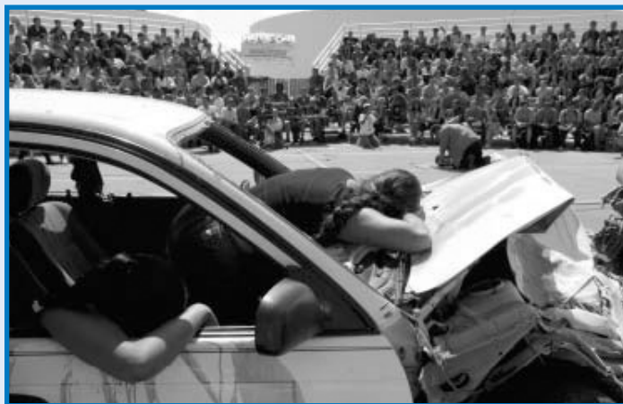
Miami Beach High School seniors get a real look at what can result in drinking and driving during a DUI car crash reenactment conducted by the Miami Beach fire and police department and Miami Beach High School students.

Since the introduction of this program, there have been no reported deaths due to DUI associated with the Miami Beach High prom night. As a result, the program was featured nationally on CNN.