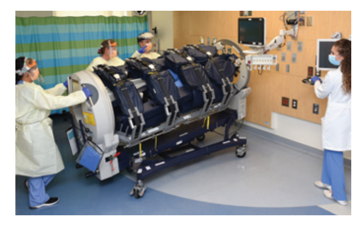
MIS-C Unit Roto-Prone Bed

Soon after the unit opened in May, the hospital received its first MIS-C patient.