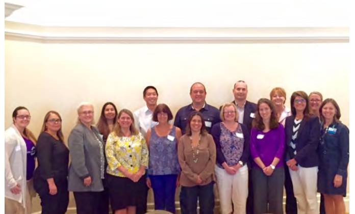
Florida Programs APPD Meeting - 2016