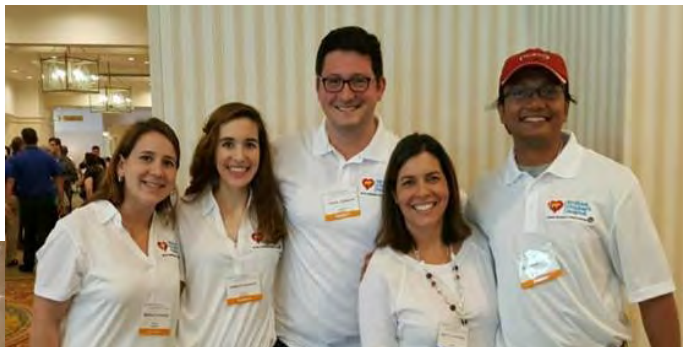
Nicklaus Children's Hospital Residency Program Team