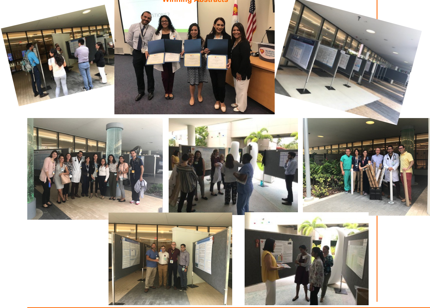
With Some of the Authors of First Place Winning Abstracts

Underlined Author: Denotes a "Trainee" ** - Denotes a Winning Peer-Reviewed Abstract * - Denotes a Presenting Author § - Denotes Late Breaking / Non-Rated Abstract