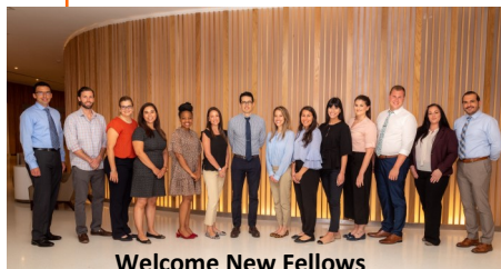
Welcome New Fellows

NCH & the Department of Medical Education welcomed the Pediatric and Dental Residents for orientation on June 12th 2019 and the Subspecialty Fellows on July